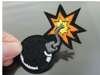
Heat cut badge example.